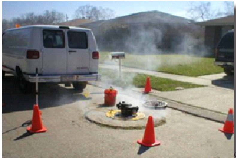
Smoke test conducted on open manhole

During the months of June through September, 2011, consultants hired by WSSC will continue its process of Smoke Testing in the Northeast Branch Sewer Basin in the municipalities College Park, Riverdale, Hyattsville, Greenbelt and Berwyn Heights, MD. This procedure will locate defects such as sewer line cracks and storm sewer cross connections. Residents and businesses will be notified when field crews are scheduled to arrive in their community within 24 to 48 hours, with a door hanger notice that will provide specific information and contact telephone numbers.