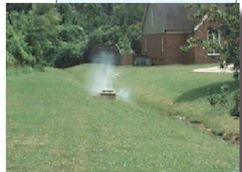
Smoke exiting the sewer system

Washington Suburban Sanitary Commission is entrusted by our community to provide safe and reliable water, life's most precious resource, and return clean water to our environment, all in an ethically and financially responsible manner.