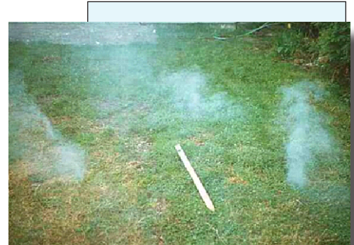
Smoke exiting the sewer system indicating defects

WSSC is the 8 largest water and wastewater utilities in the nation, serving 1.8 million residents in Prince George's and Montgomery Counties. To report water or sewer emergency, customers may call WSSC's 24-hour Emergency Response number at (301) 206-4002.